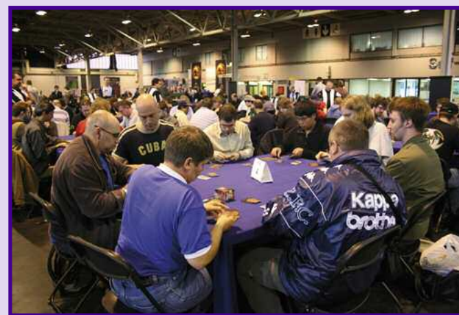
Intense concentration around the draft tables on day 2.

Last year's champions reveal their secrets, explaining all the little things that make them great players. It just remains for you to become the next star by taking your chances during this extraordinary Magic weekend.